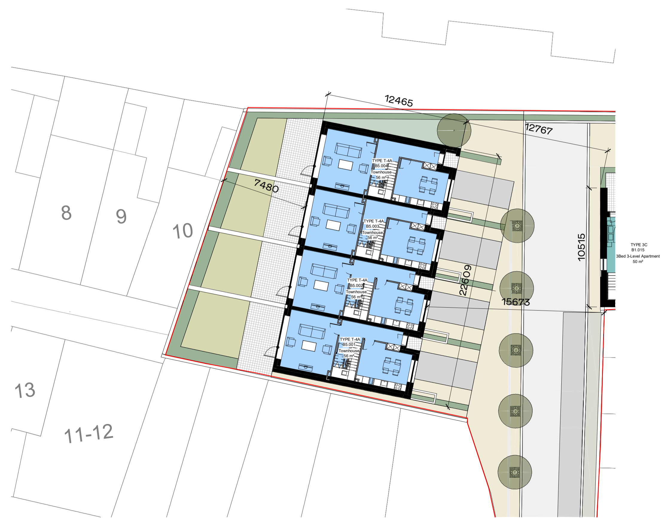
1 1200_BG5_BLOCKPLAN_L00_FFL 1 : 200