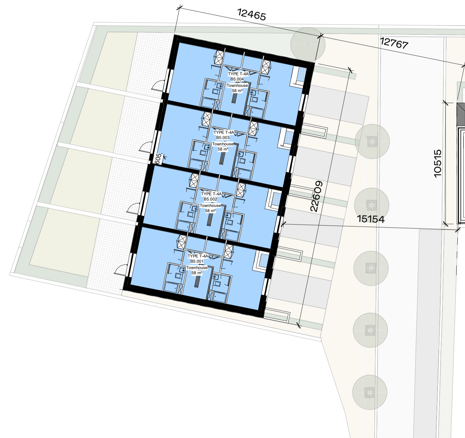
3 1200_BG5_BLOCKPLAN_L02_FFL 1 : 200